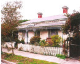
24227 26 Urquhart St