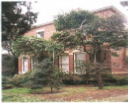
City of Darebin Heritage Review 2000