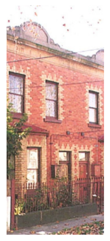
City of Darebin Heritage Review 2000