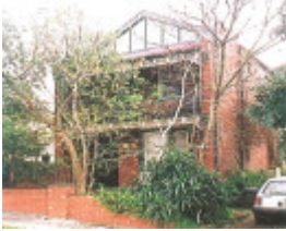
City of Darebin Heritage Review 2000