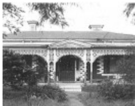
City of Darebin Heritage Review 2000