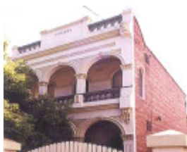
City of Darebin Heritage Review 2000