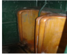
Urinal Nicholson St 21 06 2007