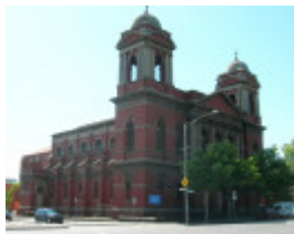
SACRED HEART CATHOLIC CHURCH SOHE 2008