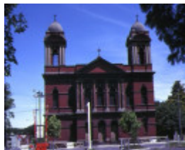
1 sacred heart church front view