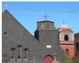
SACRED HEART CATHOLIC CHURCH SOHE 2008