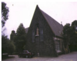
sacred heart church st georges church