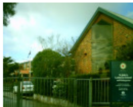
31-61 Aberdeen Street, Newtown