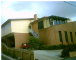
31-61 Aberdeen Street, Newtown