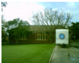
31-61 Aberdeen Street, Newtown