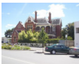
602190 national australia bank euroa3 pm1 feb04