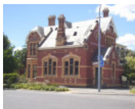
602190 national australia bank euroa1 pm1 feb04