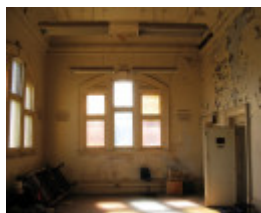
National Bank_Euroa_bank interior_KJ_Sept 08