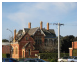
2441 Euroa old National Aust Bank