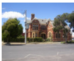
602190 national australia bank euroa5 pm1 feb04