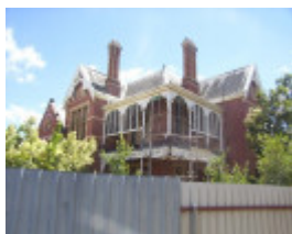
602190 national australia bank euroa6 pm1 feb04