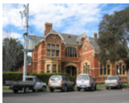
national bank_Euroa_view from Railway St_KJ_Sept 08