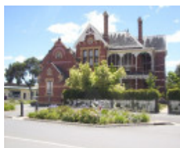
602190 national australia bank euroa2 pm1 feb04