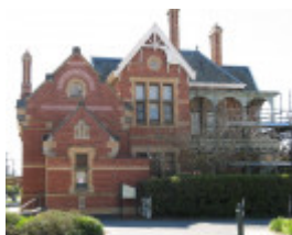
National bank_Euroa_exterior_KJ_Sept 08