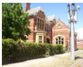
602190 national australia bank euroa4 pm1 feb04