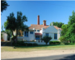
FORMER COWWARR BUTTER FACTORY SOHE 2008