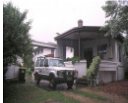
1 former cowwarr butter factory main road cowwarr north east side