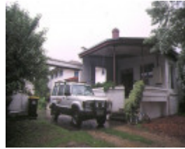
1 former cowwarr butter factory main road cowwarr north east side