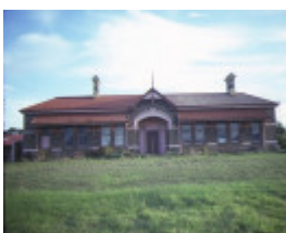
casterton railway station front view jun1984