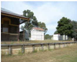
CASTERTON RAILWAY STATION SOHE 2008