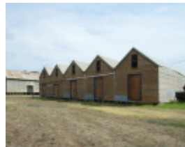
CASTERTON RAILWAY STATION SOHE 2008