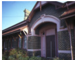
casterton railway station entrance jun1984