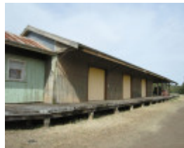
CASTERTON RAILWAY STATION SOHE 2008