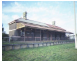
1 casterton railway station trackside view jun1984