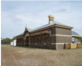
CASTERTON RAILWAY STATION SOHE 2008