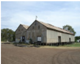
CASTERTON RAILWAY STATION SOHE 2008