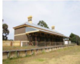
CASTERTON RAILWAY STATION SOHE 2008