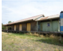
CASTERTON RAILWAY STATION SOHE 2008