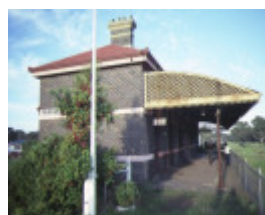
casterton railway station side view jun1984