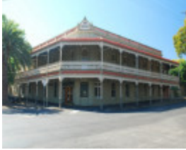
MIDLAND PRIVATE HOTEL SOHE 2008 Diagram 1209.jpg