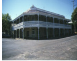
1 castlemaine coffee place templeton street castlemaine front view