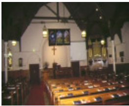
Uniting Church Lyttleton Street Castlemaine Interior Aug 1997