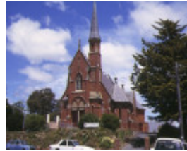
1 uniting church lyttleton street castlemaine frotn view nov1997