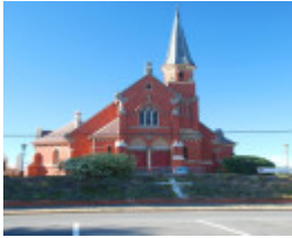
UNITING CHURCH SOHE 2008