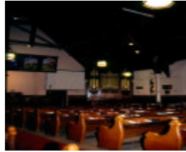
Uniting Church Lyttleton Street Castlemaine Interior Aug 1997