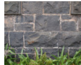
H0618 FORMER ARARAT SUB-TREASURY AND POST OFFICE LHA 2015 4.JPG