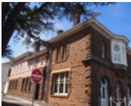
H0618 FORMER ARARAT SUB-TREASURY AND POST OFFICE LHA 2015 2.JPG