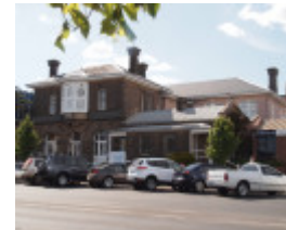
H0618 FORMER ARARAT SUB-TREASURY AND POST OFFICE LHA 2015 1.JPG