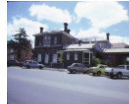
ararat post office street view nov1985