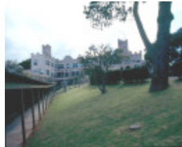
h02058 delgany portsea 1925 1953 1968 wings sept03 mz