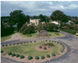
Delgany Portsea Drive September 2003