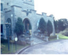
Delgany Portsea 1925 House September 2003