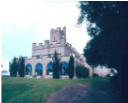
h02058 1 delgany portsea 1925 house sept03 mz