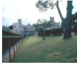
h02058 delgany portsea 1925 1953 1968 wings sept03 mz