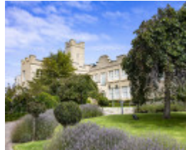
Delgany Castle with formal gardens