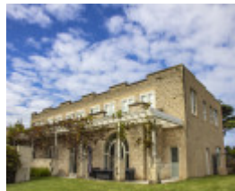
Delgany Castle image 4