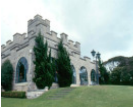
Delgany Portsea 1925 House September 2003