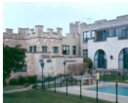
Delgany Portsea Rear of 1925, 1953 and 1968 Wings House September 2003