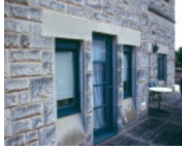
Delgany Portsea 1925 House Windows and Doors September 2003