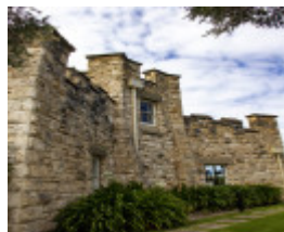
Delgany Garage image 3