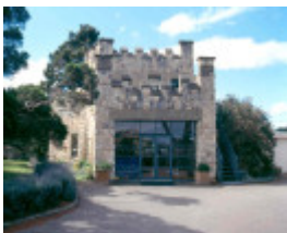
h02058 delgany portsea garage sept03 mz