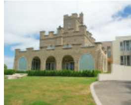
DELGANY SOHE 2008