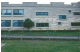
Delgany Portsea Join of 1953 and 1925 House September 2003