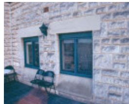
h02058 delgany portsea 1925 windows sept03 mz