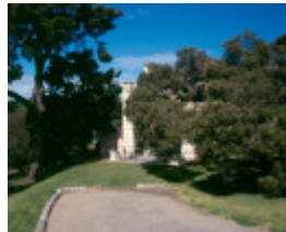
Delgany Portsea Garage and Drive September 2003