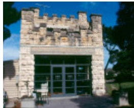
Delgany Portsea Garage September 2003