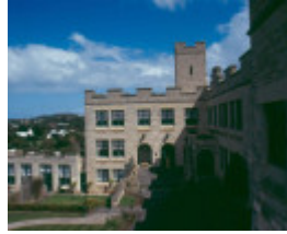
Delgany Portsea 1953 Wing September 2003