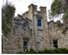
Delgany Garage image 1