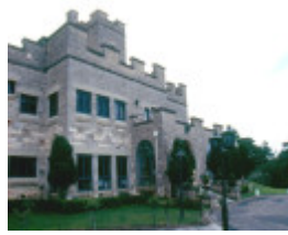
Delgany Portsea 1925 House September 2003