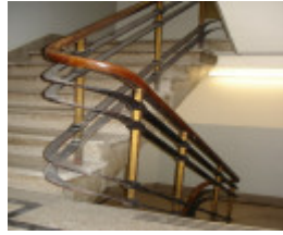
Myers Melbourne Stairs 1930s February 2006