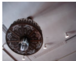
H2100 Myers Melbourne mural hall chandelier feb2006 jb 029