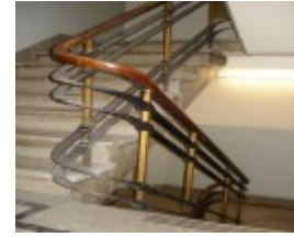
Myers Melbourne Stairs 1930s February 2006