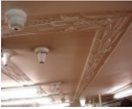
H2100 Myers Melbourne ceiling detail feb2006 jb 047