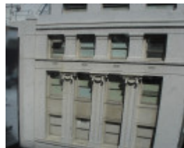
Myers Melbourne Little Bourke Street February 2006