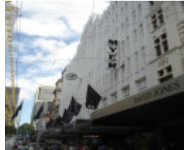
H2100 myers melbourne bourke street facade 2 jan 06 jb