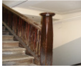
H2100 Myers Melbourne stair arts craft feb2006 jb 018