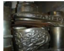
H2100 Myers Melbourne lamson tubes close detail feb2006 jb 005