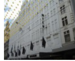
Myers Melbourne Bourke Street Facade January 2006