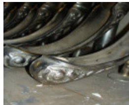
Myers Melbourne Lamson Tubes Detail February 2006