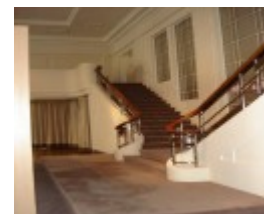
Myers Melbourne Mural Hall Stairs February 2006