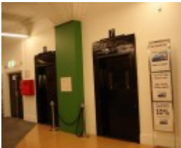
Myers Melbourne Elevators 5th Floor February 2006