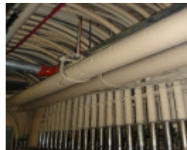
Myers Melbourne Lamson Tubes Ceiling February 2006