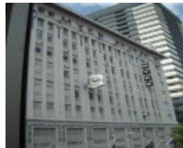
H2100 myers melbourne lonsdale street facade jan06 jb