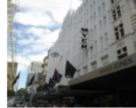
H2100 myers melbourne bourke street facade 2 jan 06 jb