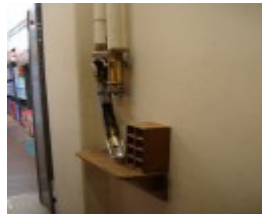
Myers Melbourne Lamson Tube February 2006