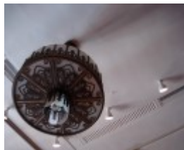
H2100 Myers Melbourne mural hall chandelier feb2006 jb 029