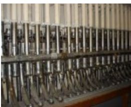
Myers Melbourne Lamson Tubes February 2006