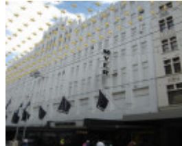
H2100 myers melbourne bourke street facade jan 06 jb