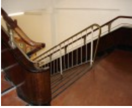
H2100 myers melbourne deco stairs 21 02 06 JB