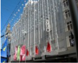
MYER MELBOURNE (FORMER MYER EMPORIUM) SOHE 2008