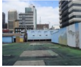
Myers Melbourne Rooftop Carnival February 2006