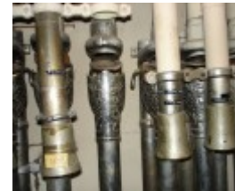
Myers Melbourne Lamson Tubes February 2006