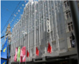
MYER MELBOURNE (FORMER MYER EMPORIUM) SOHE 2008