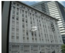
H2100 myers melbourne lonsdale street facade jan06 jb