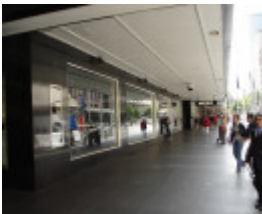
H2100 myers melbourne bourke street windows 21 02 06 JB