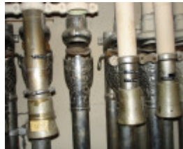
Myers Melbourne Lamson Tubes February 2006