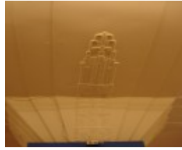
H2100 Myers Melbourne column detail feb2006 jb 043