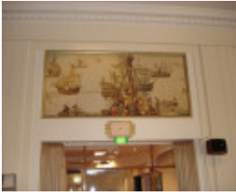
Myers Melbourne Mural Hall February 2006