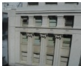
Myers Melbourne Little Bourke Street February 2006