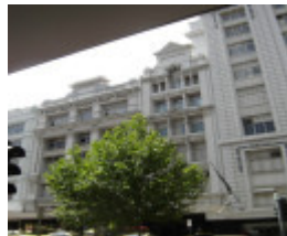
H2100 myers melbourne lonsdale street 19thc jan 06 jb