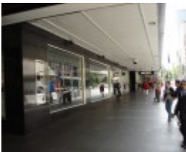
H2100 myers melbourne bourke street windows 21 02 06 JB