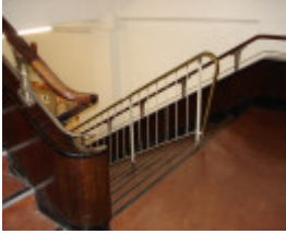
H2100 myers melbourne deco stairs 21 02 06 JB