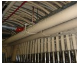
Myers Melbourne Lamson Tubes Ceiling February 2006