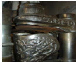
H2100 Myers Melbourne lamson tubes close detail feb2006 jb 005