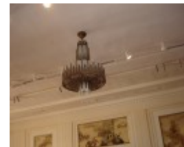
H2100 Myers Melbourne mural hall chandelier feb2006 jb 019