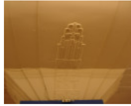
H2100 Myers Melbourne column detail feb2006 jb 043