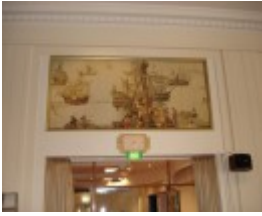
Myers Melbourne Mural Hall February 2006