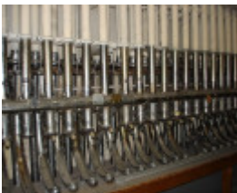
Myers Melbourne Lamson Tubes February 2006