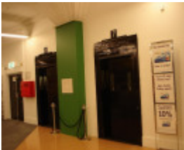
Myers Melbourne Elevators 5th Floor February 2006