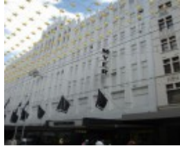
H2100 myers melbourne bourke street facade jan 06 jb