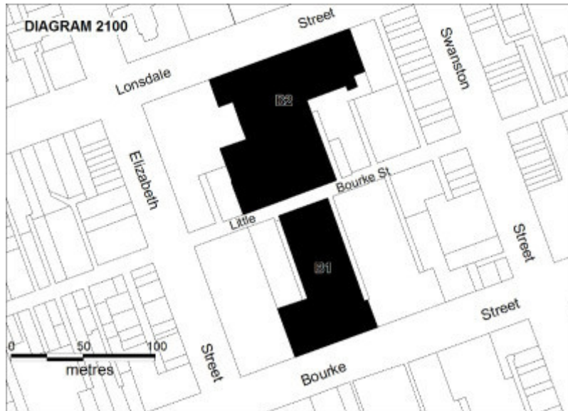
H2100 myer emporium final extent plan