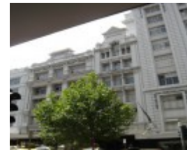
H2100 myers melbourne lonsdale street 19thc jan 06 jb