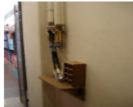
Myers Melbourne Lamson Tube February 2006