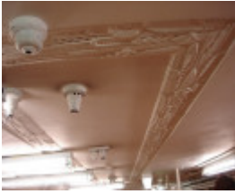
H2100 Myers Melbourne ceiling detail feb2006 jb 047