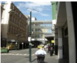
H2100 myers melbourne little bourke street sky bridge jan06 jb