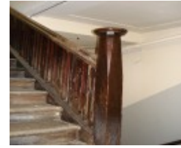
H2100 Myers Melbourne stair arts craft feb2006 jb 018