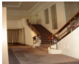
Myers Melbourne Mural Hall Stairs February 2006