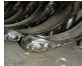
Myers Melbourne Lamson Tubes Detail February 2006