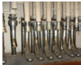
H2100 Myers Melbourne lamson tubes 3 feb2006 jb 004