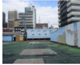
Myers Melbourne Rooftop Carnival February 2006