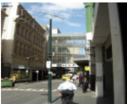
H2100 myers melbourne little bourke street sky bridge jan06 jb