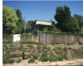
1 residence bowden street castlemaine front view