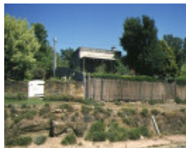
1 residence bowden street castlemaine front view