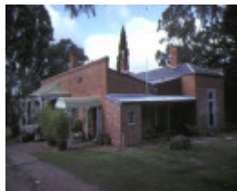
residence burnet road castlemaine rear view jul1981