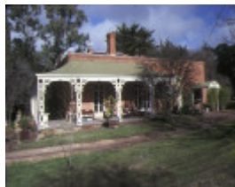
1 residence burnet road castlemaine front view jul1981