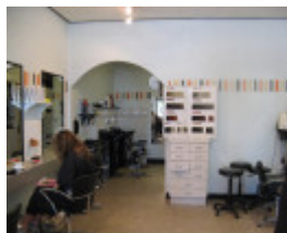
Foster_Building_Maffra_KJ_Ap interior no 67