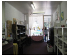
Foster_Building_Maffra_KJ_Ap interior no 69