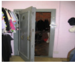
Foster_Building_Maffra_KJ_Ap 69 strong room