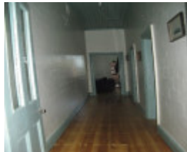
Foster_Building_Maffra_KJ_Ap floor no 71