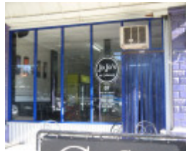
Foster_Building_Maffra_KJ_Ap no 71