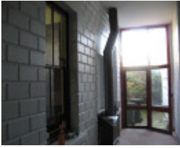
Foster building Maffra 12 Apr 2012 KJ (20) no 67.JPG