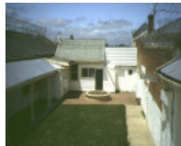
former hm prison challis street castlemaine forecourt & administration building dec1992