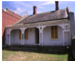
former hm prison challis street castlemaine govomers rsidence jan1996