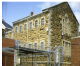
former hm prison challis street castlemaine rear view of cell block