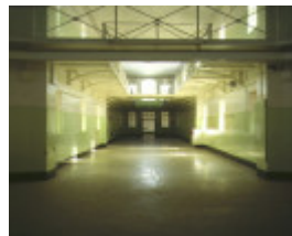
former hm prison challis street castlemaine interior corridor dec1992