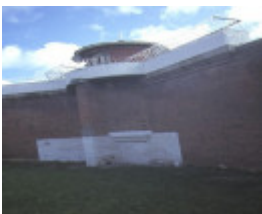
former hm prison challis street castlemaine watch tower & walls aug1984