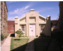
former hm prison challis street castlemaine industry building jan1996