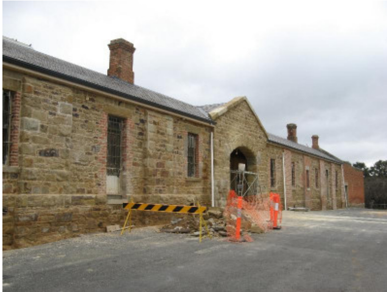
facade conservation as at 25May2011 005.jpg