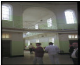
former hm prison challis street castlemaine centre of cell block