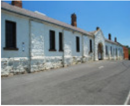
FORMER HM PRISON SOHE 2008