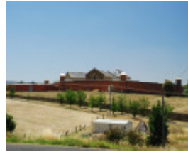
FORMER HM PRISON SOHE 2008