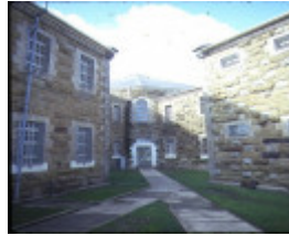
1 former hm prison challis street castlemaine cell block entrance aug1984