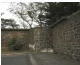
mental hospital ararat wall & watch tower