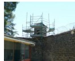
J WARD (ARARAT ASYLUM) SOHE 2008