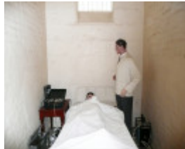
J WARD (ARARAT ASYLUM) SOHE 2008