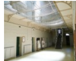
J WARD (ARARAT ASYLUM) SOHE 2008