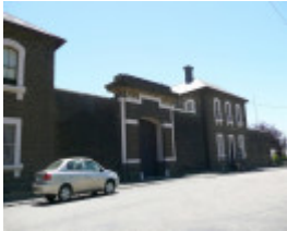
J WARD (ARARAT ASYLUM) SOHE 2008