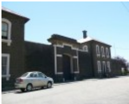
J WARD (ARARAT ASYLUM) SOHE 2008