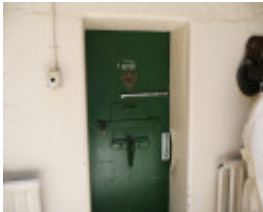
J WARD (ARARAT ASYLUM) SOHE 2008