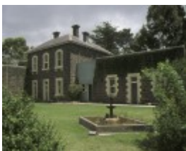
1 mental hospital ararat courtyard view