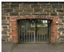
mental hospital ararat gate 1994