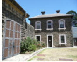
J WARD (ARARAT ASYLUM) SOHE 2008