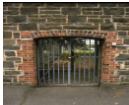
mental hospital ararat gate 1994