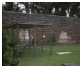
mental hospital ararat wall paintings