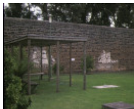
mental hospital ararat wall paintings