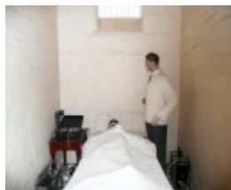
J WARD (ARARAT ASYLUM) SOHE 2008