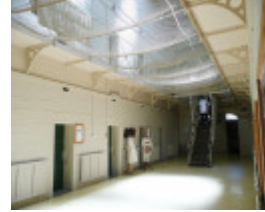
J WARD (ARARAT ASYLUM) SOHE 2008