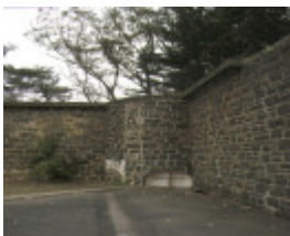
mental hospital ararat wall & watch tower