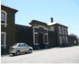
J WARD (ARARAT ASYLUM) SOHE 2008