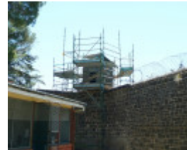
J WARD (ARARAT ASYLUM) SOHE 2008