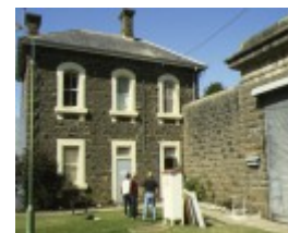
mental hospital ararat front gate & gatehouse