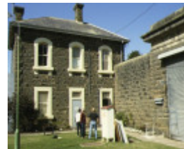
mental hospital ararat front gate & gatehouse