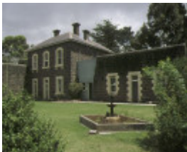
1 mental hospital ararat courtyard view