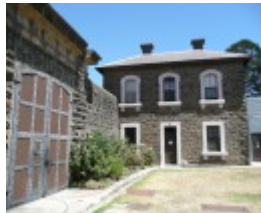
J WARD (ARARAT ASYLUM) SOHE 2008