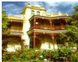
1 wardlow nov 2000