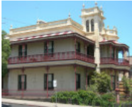
WARDLOW SOHE 2008