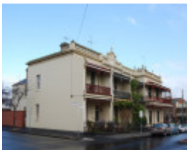
H1922 Residences 33 37 Degraves St 02