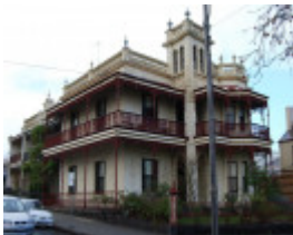
H1922 Residence Cnr Degraves St and Park Dve 1 02