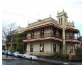
H1922 Residence Cnr Degraves St and Park Dve 2 02