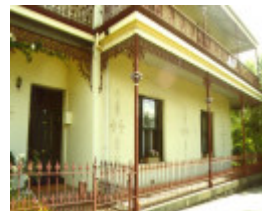
Wardlow Houses in Degraves Street