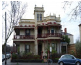
H1922 Residence Cnr Degraves St and Park Dve Facade 02