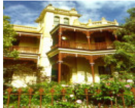
1 wardlow nov 2000