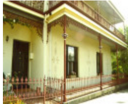
Wardlow Houses in Degraves Street