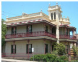
WARDLOW SOHE 2008