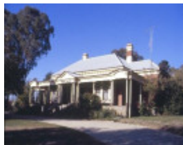
h00721 kaweka hargreaves street castlemaine front of home she project 2003