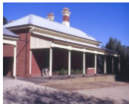
h00721 kaweka hargreaves street castlemaine east side she project 2003