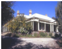
h00721 1 kaweka hargreaves street castlemaine house from drive she project 2003