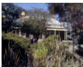
h00721 kaweka hargreaves street castlemaine house from pond she project 2003