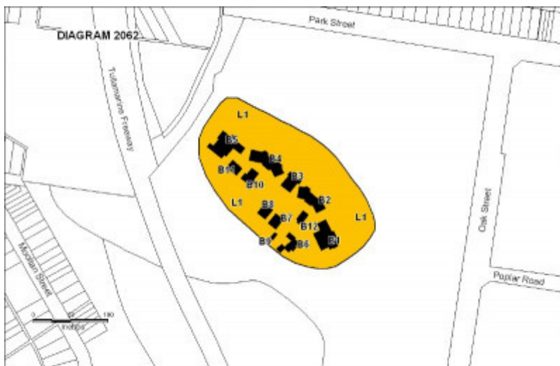
Royal Park Hospital Plan Old