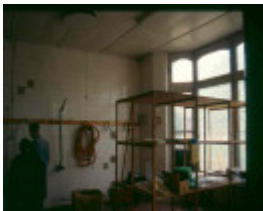
h02062 royal park hospital mortuary interior apr02 pm1