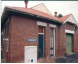
Royal Park Hospital Workshop April 2002