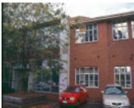
Royal Park Hospital Admin April 2002