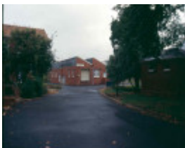
Royal Park Hospital Demolished April 2002