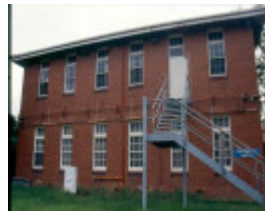
h02062 royal park hospital male attendants block apr02 pm1