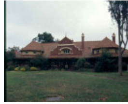
Royal Park Hospital Ward April 2002