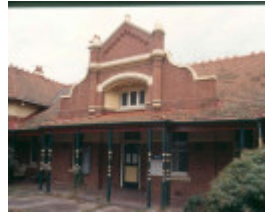
h02062 1 royal park hospital ward apr02 pm1