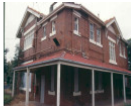
h02062 royal park hospital male workers apr02 pm1