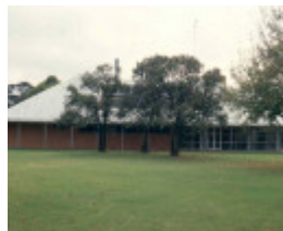
Royal Park Hospital April 2002