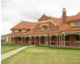
FORMER ROYAL PARK PSYCHIATRIC HOSPITAL SOHE 2008