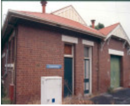
Royal Park Hospital Workshop April 2002