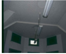
Royal Park Hospital Ward Ceiling April 2002