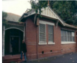
h02062 royal park hospital mortuary apr02 pm1