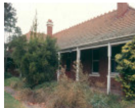
Royal Park Hospital April 2002