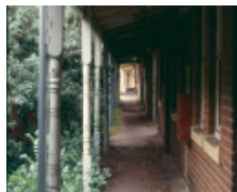
Royal Park Hospital Verandah April 2002