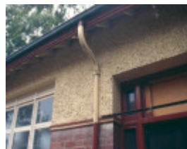
Royal Park Hospital Detail April 2002