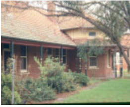
Royal Park Hospital Ward April 2002