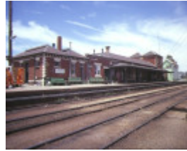
1 wangaratta railway station complex norton street wangaratta trackside view dec1984