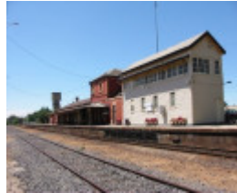
Wangaratta RWS Signal Box& Station Building February 2002