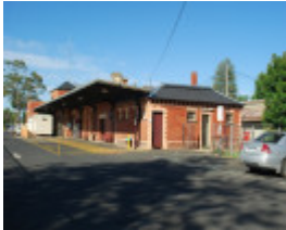
WANGARATTA RAILWAY STATION COMPLEX SOHE 2008