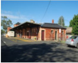
WANGARATTA RAILWAY STATION COMPLEX SOHE 2008