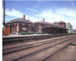
1 wangaratta railway station complex norton street wangaratta trackside view dec1984