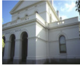
castlemiane court house lyttleton street castlemaine entrance detail aug1984