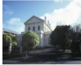
1 castlemaine court house lyttleton street castlemaine front view aug1984