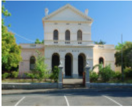
COURT HOUSE SOHE 2008