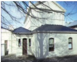
castlemaine court house lyttleton street castlemaine rear view aug1984