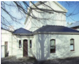
castlemaine court house lyttleton street castlemaine rear view aug1984