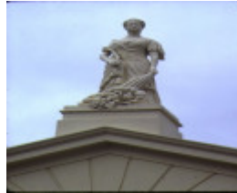
castlemaine market castlemaine detail of pediment