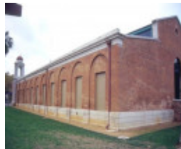
castlemaine market building mostyn street castlemaine side elevation she project 2003