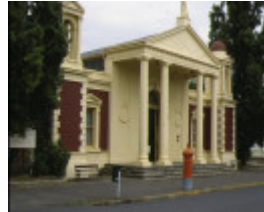
1 castlemaine market castlemaine front view