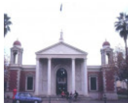
castlemaine market building mostyn street castlemaine front elevation she project 2003