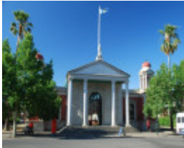
CASTLEMAINE MARKET SOHE 2008