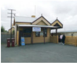
QUEENSCLIFF RAILWAY STATION SOHE 2008