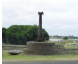
QUEENSCLIFF RAILWAY STATION SOHE 2008