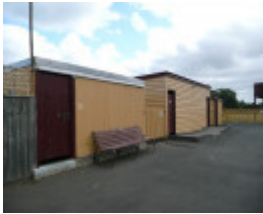
QUEENSCLIFF RAILWAY STATION SOHE 2008