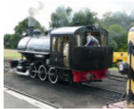
QUEENSCLIFF RAILWAY STATION SOHE 2008