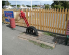
QUEENSCLIFF RAILWAY STATION SOHE 2008