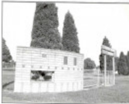
26949 Barwon Heads Road South Barwon Reserve Memorial Photo