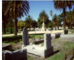
1williamstown cemetery fountain crossroads may1999