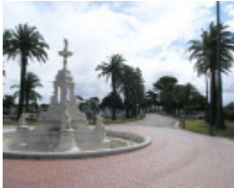
WILLIAMSTOWN CEMETERY SOHE 2008