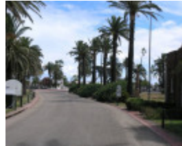
WILLIAMSTOWN CEMETERY SOHE 2008