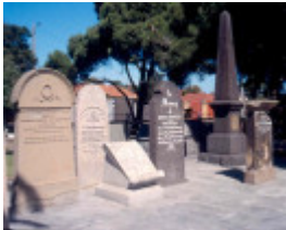
Williamstown Cemetery Gellibrand Vault May 1999