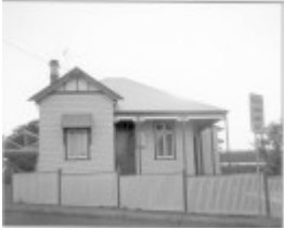
26953 Church Street No 2 Photo