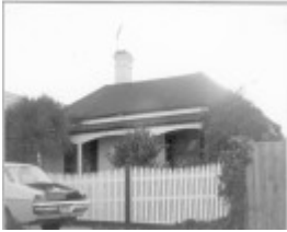
26955 Church Street No 8 Photo