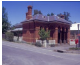
Former Chewton Post Office Pyrenees Hwy Chewton Front and East Wall SHE Project 2004