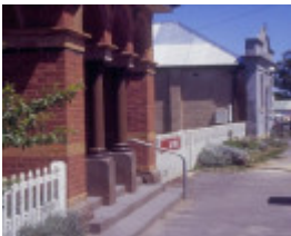
Former Chewton Post Office Pyrenees Hwy Post Office and Town Hall SHE Project 2004