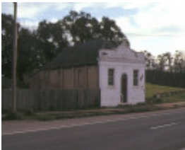
h01015 chewton town hall pyrenees hwy chewton front view sep1988