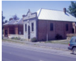
chewton town hall pyrenees highway chewton town hall and post office she project 2003