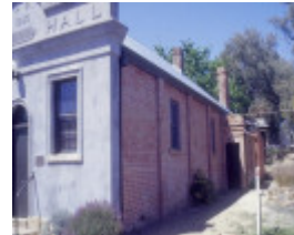
chewton town hall pyrenees highway chewton west wall she project 2003