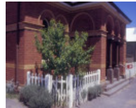
Former Chewton Post Office Pyrenees Hwy Chewton North East Conrner SHE Project 2004