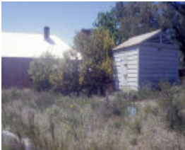
chewton town hall pyrenees highway chewton portable police lock up she project 2003