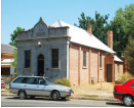
CHEWTON TOWN HALL SOHE 2008