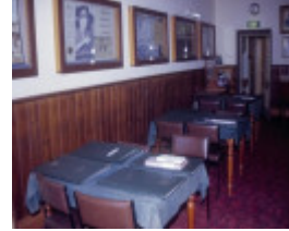
chewton town hall pyrenees highway chewton interior she project 2003