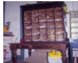
Former Chewton Post Office Pyrenees Hwy Chewton Front Sorting Mailbox SHE Project 2004