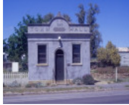
h01015 1 chewton town hall pyrenees highway chewton front she project 2003