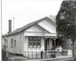
26976 Evans Street No 27 Photo