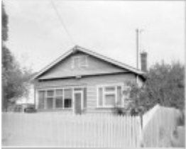
26978 Francis Street No 4 Photo