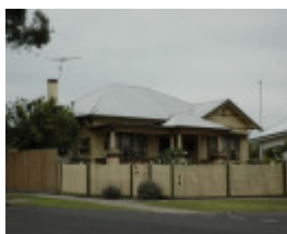
28 George Street, Belmont