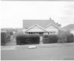
19 Herd Road, Belmont