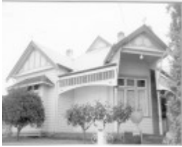
26992 High Street No 86 Photo