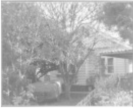
27010 High Street No 268 Photo