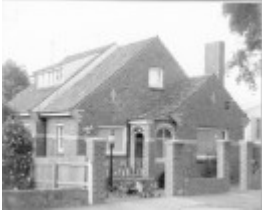
27011 Kardinia Street No 11 Photo