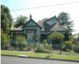
44 Kardinia Street, Belmont