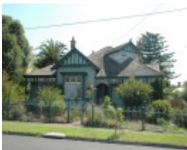
44 Kardinia Street, Belmont