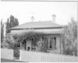
27014 McDonald Street No 2 Photo