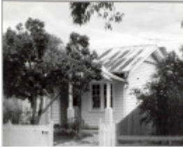
27017 Mitchell Street No 22 Photo