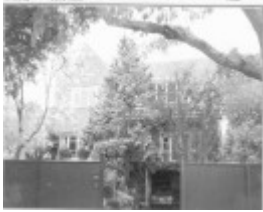
27018 Morris Street No 7 Photo