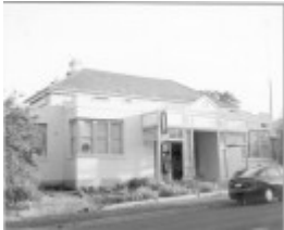
27038 Mt Pleasant Road No 31 Photo