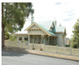
44 Mt Pleasant Road, Belmont