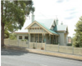
44 Mt Pleasant Road, Belmont