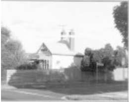
27047 Mt Pleasant Road No 49 Photo