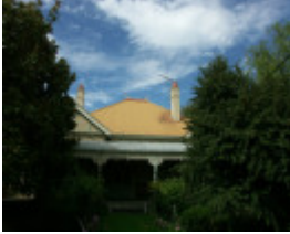
67 Mt Pleasant Road, Belmont