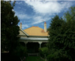
67 Mt Pleasant Road, Belmont