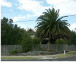
71 Mt Pleasant Road, Belmont